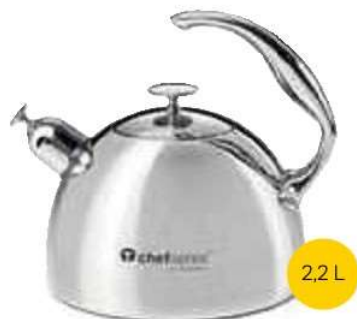
100902 Chef Series Water Kettle (2,2 L) R2200