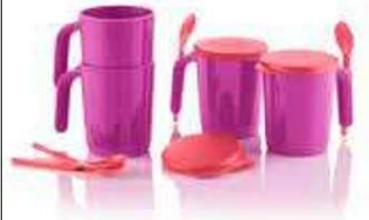
154911 Illumina Mugs (x 4) WAS R199 R149 SAVE R50