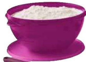
142646 That's a Bowl (4,5 L) WAS R140 R119 SAVE R21