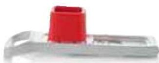
145365 *Speedy Grater R439