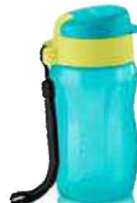
996913 Eco Bottle (310 ml) WAS R101 R79 SAVE R22