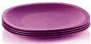
156930 Legacy Plates (x 4) WAS R289 R189 SAVE R100