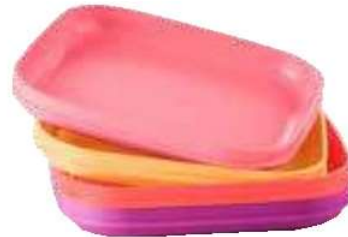
154527 Picnic Plates WAS R229 R179 SAVE R50