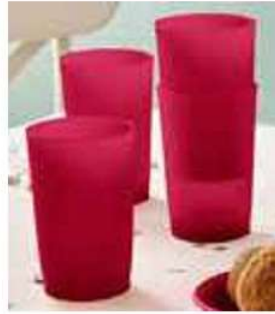
153571 Decorator Tumblers (200 ml x 4) WAS R109 R99 SAVE R10