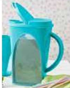
136708 Outdoor Dining Pitcher (1,7 L) WAS R149 R139 SAVE R10