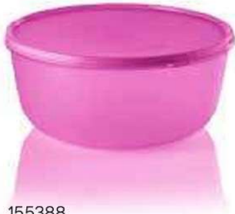
155388 Modular Bowl (4 L) WAS R249 R139 SAVE R110