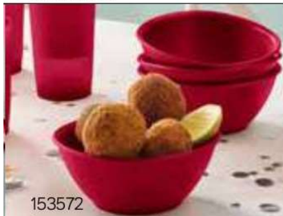
153572 Legacy Bowls (400 ml x 4) WAS R165 R99 SAVE R66