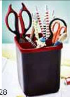
154528 Stationery Holder WAS R179 R69 SAVE R110