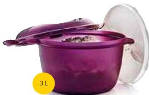
122994 Microwave Rice Maker Large (3 L) R269