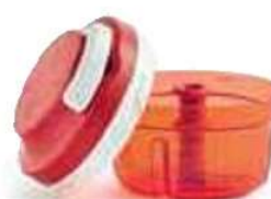
120307 *Herb Chopper (300 ml) 10,8 cm diameter x 9,2 cm high WAS R439 R339 SAVE R100