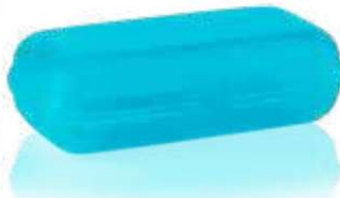
153345 Oyster Oblong WAS R99 R49 SAVE R50