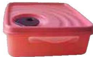
155834 CrystalWave Snack Box WAS R155 R99 SAVE R56