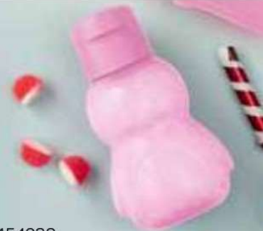
154038 Penguin Eco Bottle WAS R109 R59 SAVE R50