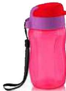
996912 Eco Bottle (310 ml) WAS R101 R79 SAVE R22