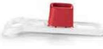
131820 *Speedy Mando R439

*Blades not covered by the Tupperware® Warranty