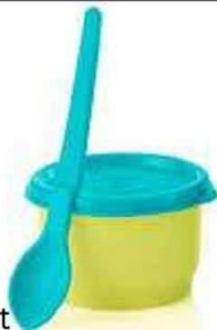
996901 Baby Set WAS R80 R49 SAVE R31