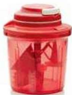
133286 *Extra Chef with Pull Cord (1,35 L) 15,6 cm diameter x 19,5 cm high R1080