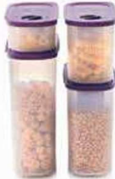
996900 Time Keeper Set WAS R704 R249 SAVE R455