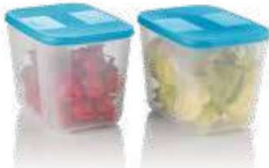
154913 Fridge Mate (1 L x 2) WAS R179 R99 SAVE R80