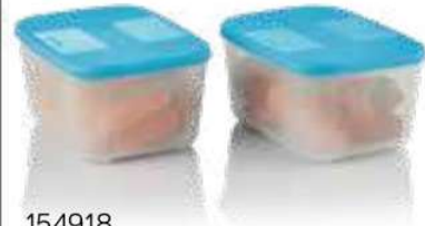
154918 Fridge Mate (700 ml x 2) WAS R159 R89 SAVE R70