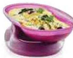
126970 Micro Delight (430 ml) R135